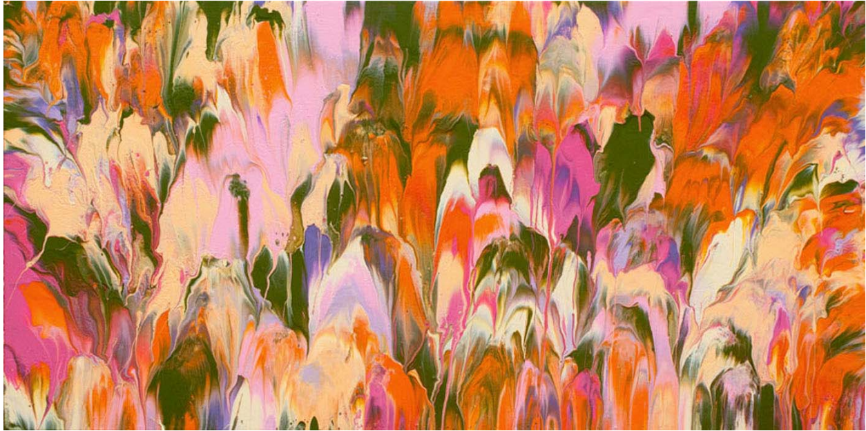
Tulips 1 , 24 x 48 inches, repurposed acrylic latex paint on canvas