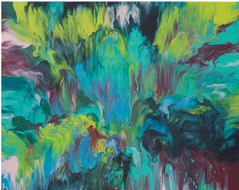
Orchids 2 , 24 x 30 inches, repurposed acrylic latex paint on canvas